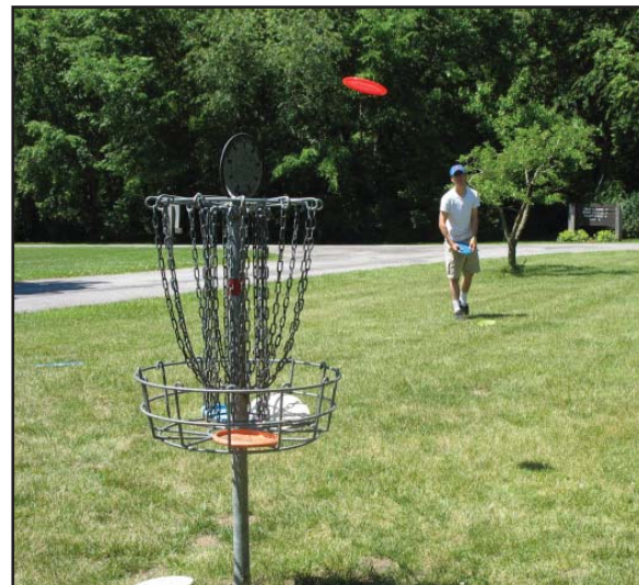
For more information about programs and activities at St. Joseph County Parks visit our website at www.sjcparks.org .