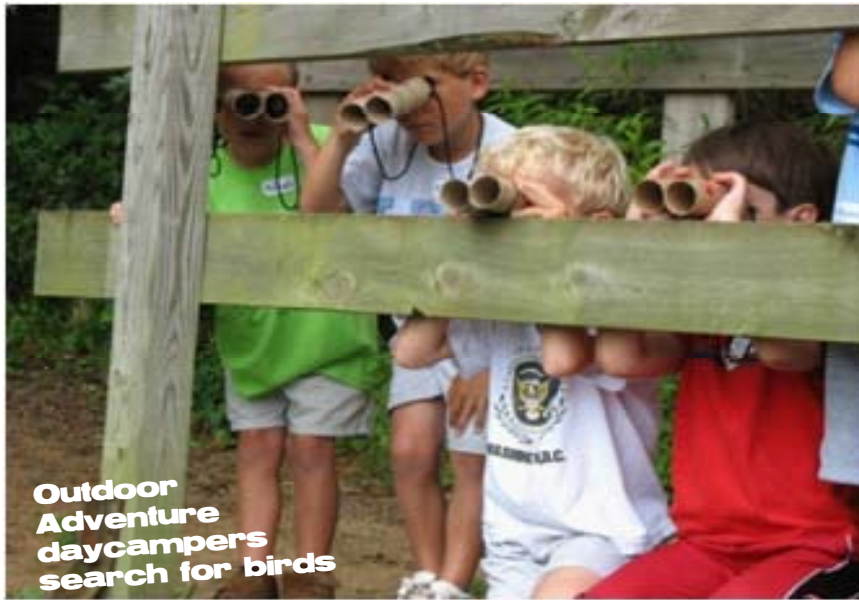
Outdoor Adventure daycampers search for birds