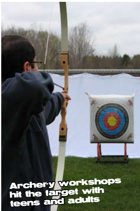
Archery workshops hit the target with teens and adults

We partnered with Kingsbury Fish and Wildlife Area to conduct lotteries for public waterfowl hunting in fall. 25 parties of 60 hunters harvested 91 waterfowl.