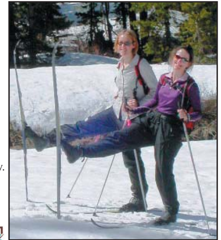
>> Friends stop to pose after skiing the day away.