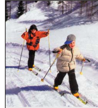
^^ Young skiers enjoy outdoor fun.