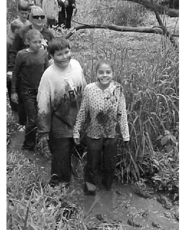
Spicer Lake Nature Preserve is a great place for families, friends and schools to explore!