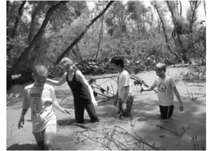
"Swamp-stompers" explore the wetland during an interpretive program.