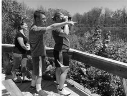
Spicer Lake Nature Preserve provides habitat for many species of migratory birds.