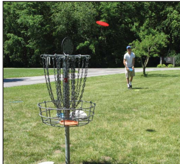
For more information about programs and activities at St. Joseph County Parks visit our website at: www.sjcparks.org .